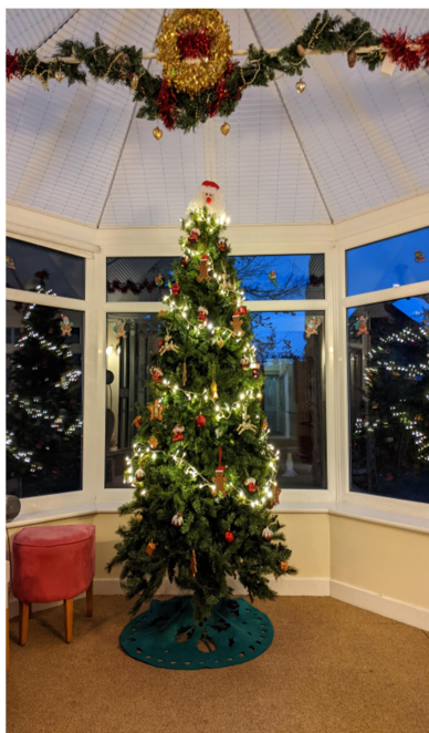
Christmas tree in the conservatory

We wish you all a blessed and peaceful Christmas