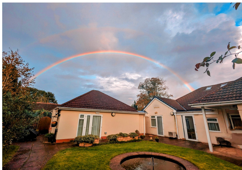
Lime Tree House encircled by a rainbow recently in the circle of Love